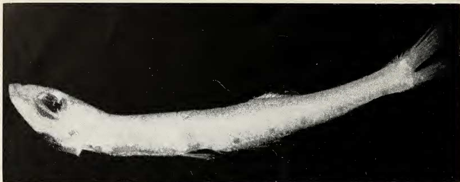
FIG. 1. Araiophos gracilis , holotype, standard length 34 mm.